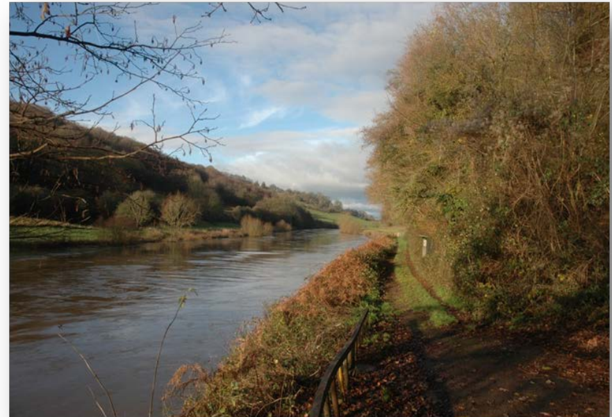
Part of the Wye Valley Walk, running beside the River Wye

The Wye Valley Walk runs along the riverside. Paths are rough in places.