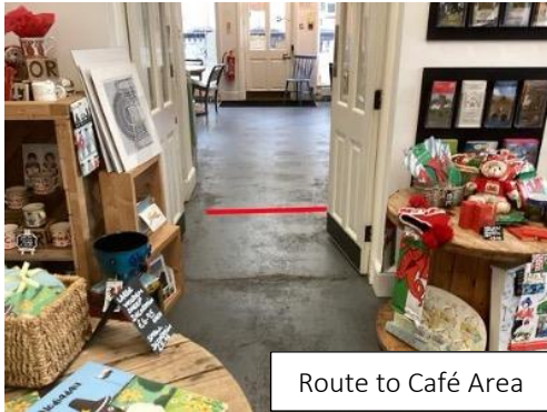
Route to Café Area