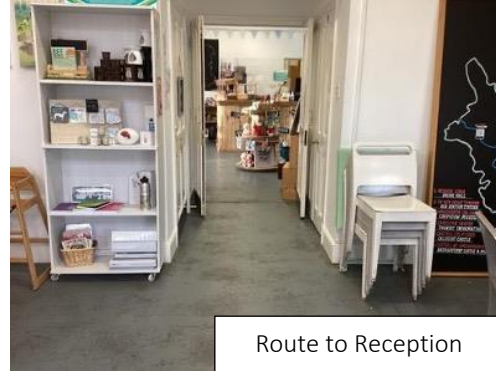
Route to Reception