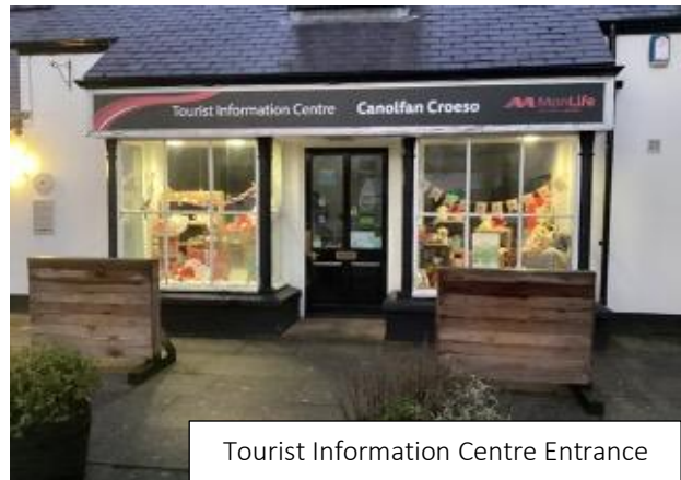
Tourist Information Centre Entrance