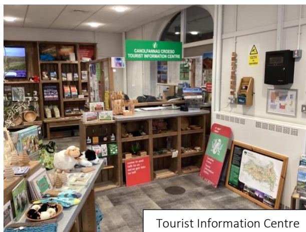
Tourist Information Centre