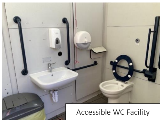
Accessible WC Facility