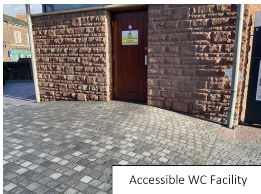
Accessible WC Facility