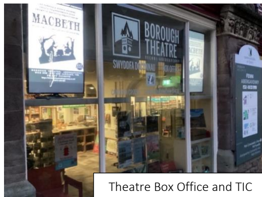
Theatre Box Office and TIC