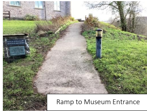
Ramp to Museum Entrance